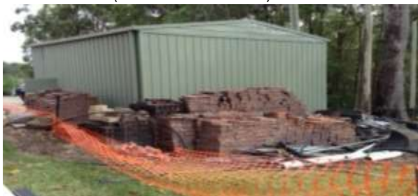
A Clay Paver Pyramid