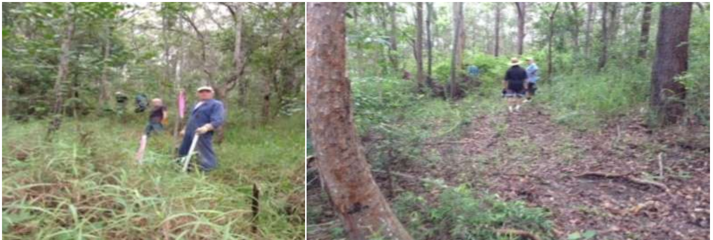
Survey work at the new site