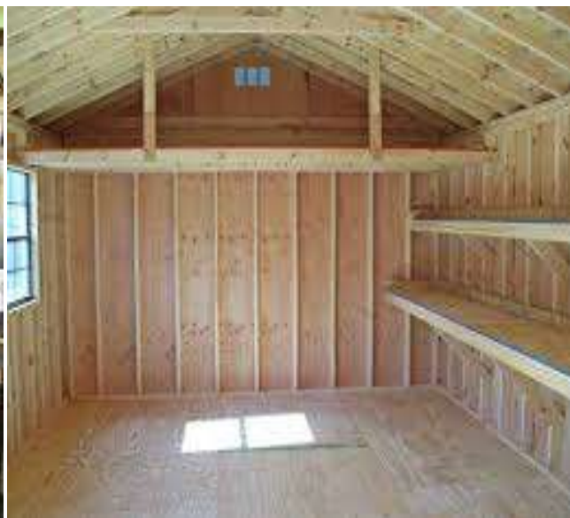
A great example of an even tidier shed.