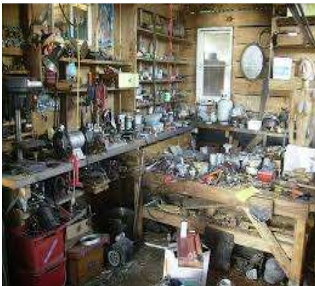
A great example of a tidy shed