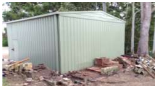
At this rate, we'll have that shed demolished in no time