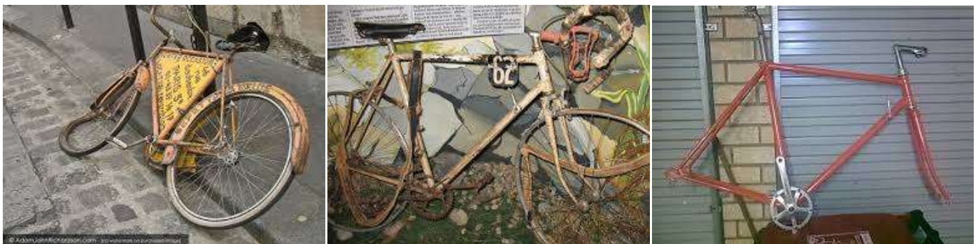
Turning old junk into something useful is easy - Just ask Ron...